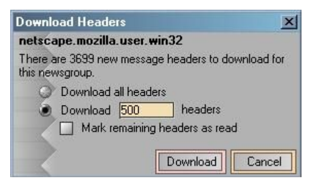
Figure 4.5: Downloading News Headers

Downloading Headers Now that we have some newsgroups listed in our folder pane, let's see what content is available therein. In your folder pane on the left, you should see a listing of the groups to which you have subscribed under the name of the newsgroup account. When you click on one of these groups, Mozilla will ask the server how many active messages there are in the group. If it is more than specified in the Server Settings portion, then it will ask you how many headers you want to get. (See Figure 4.5 Notice, in