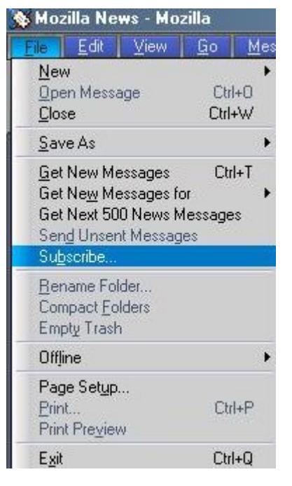
Figure 4.3: Subscribe Menu Option